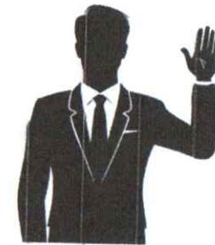
Pimpinan ( Kabag Umum )